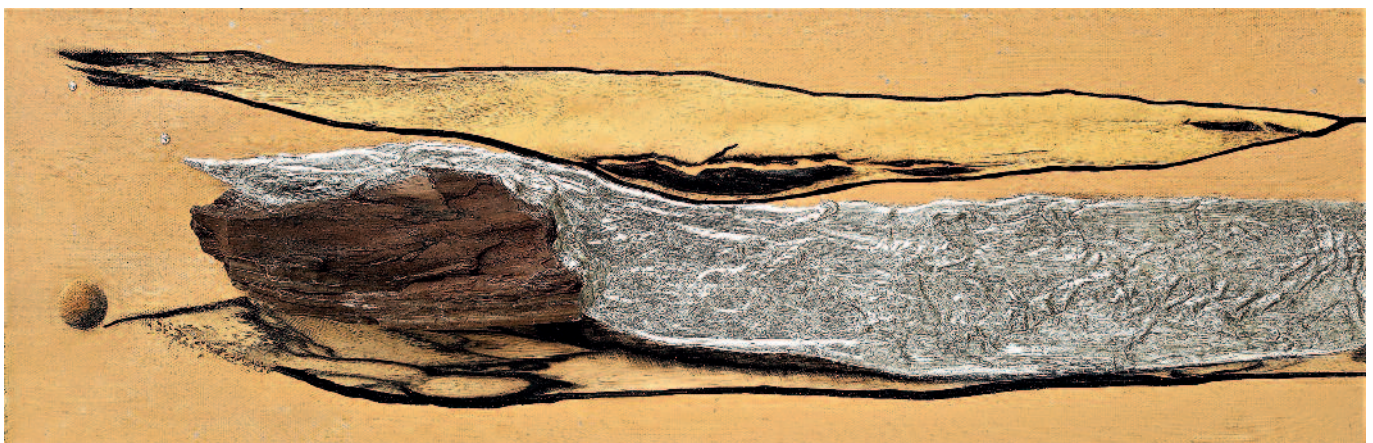
„Wood-Stone“, petrified wood, veneer, metal, acrylic and chalk on canvas 20 x 15 x 50 cm