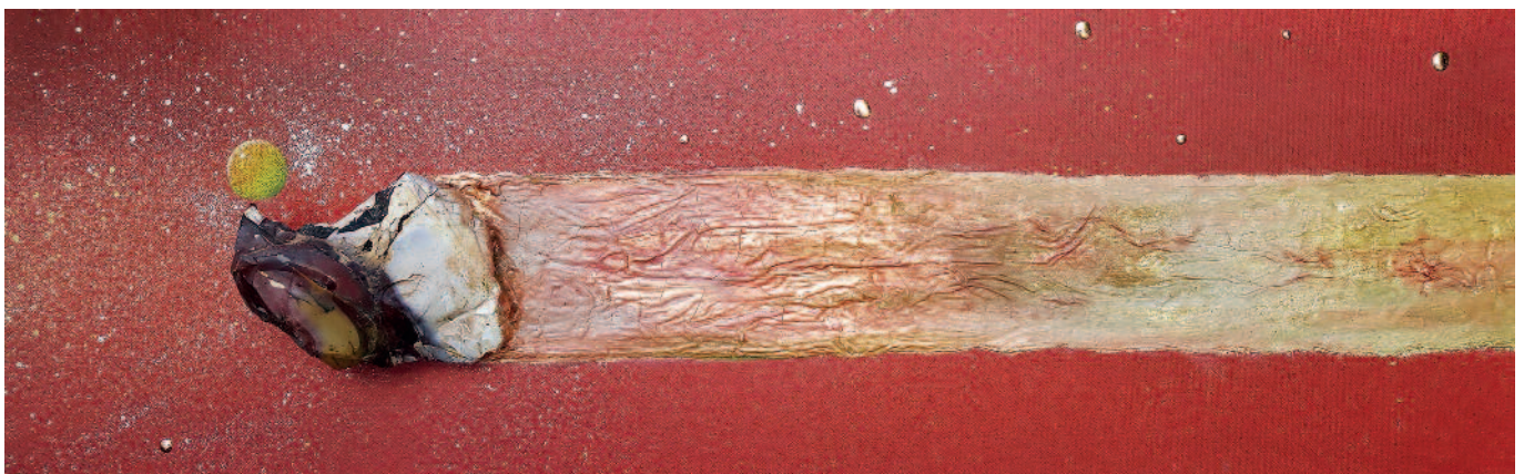
„Posteritas“, mokaite jasper, oil, chalk and metal on canvas, 300 x 70 cm