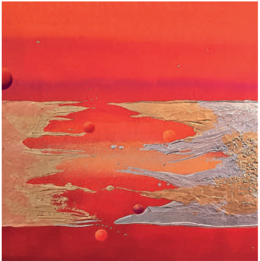
„Materie-Antimaterie“, mixed media, 100 x 100 cm

On her canvases Sica combines stones, metal, wood, textiles, diamond dust, acrylic and oil and thus creates paintings, which dispel the widely held assumption of two-dimensionality in paintings. Sica’s paintings have depth – haptically and textually. Every uneven detail shows the interactions between the materials which at times are connected in unexplainable ways – Sica seems to be defying gravity in her artworks. She has developed a technique of her own to attach heavy materials with low adhesion to canvases – a secret she hasn’t revealed so far.